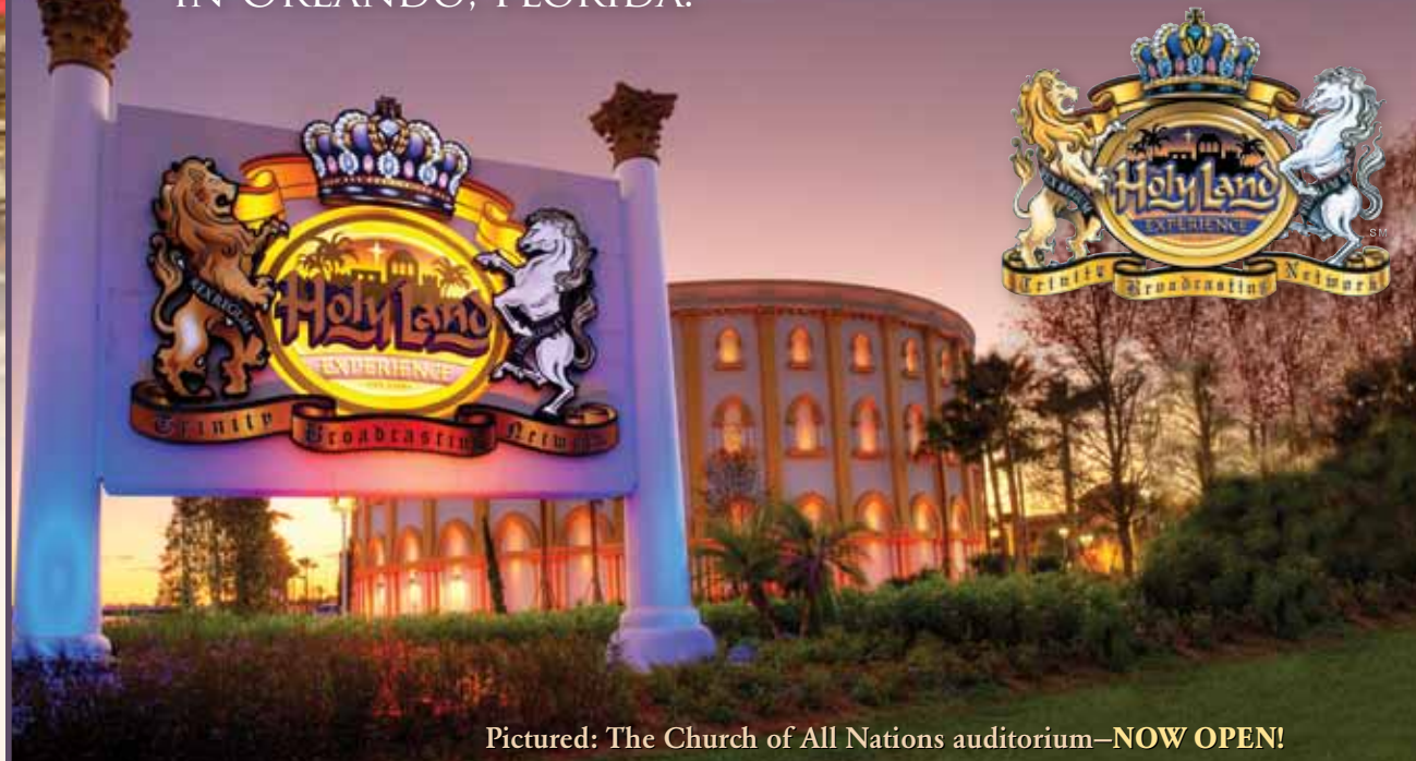
Pictured: The Church of All Nations auditorium—NOW OPEN!

EXPERIENCE LOVE...EXPERIENCE PEACE... EXPERIENCE JESUS AT THE HOLY LAND EXPERIENCE IN ORLANDO, FLORIDA.