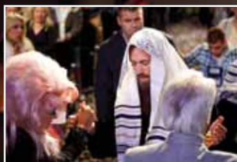
Benny Hinn was on hand for the very first ordination service held at the Church of All Nations.